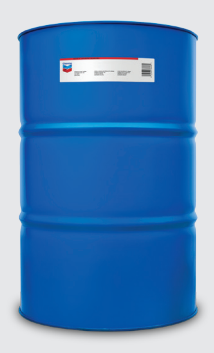
Meropa XL 220