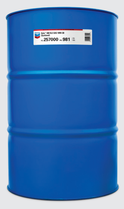
Delo® 400 XLE SAE 10W-30