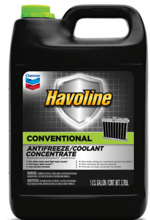
Concentrate 226110, Premixed 50/50 226821