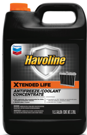
Concentrate 236542, Premixed 50/50 236543