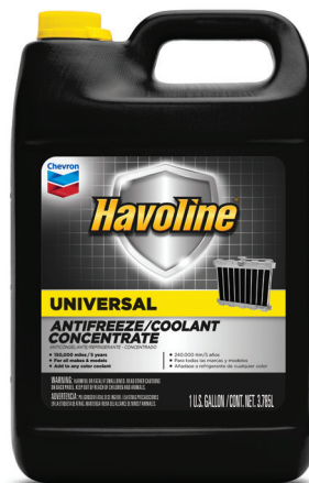
Concentrate 227062, Premixed 50/50 227063