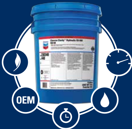
Clarity® Synthetic Hydraulic Oil AW

Chevron has designed an entire line of premium hydraulic fluids to best meet your operation's needs. Each is precisely formulated to help maximize performance and savings.