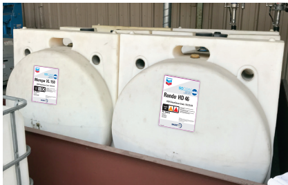
Chevron SmartFill™ labels ensure the correct Chevron Certified lubricant is installed.